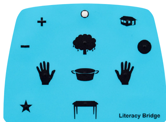
Figure 3. Selected Talking Book icon set, 2012