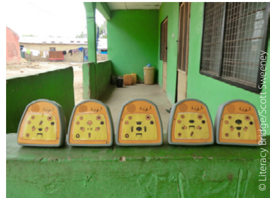
Figure 2. Various icon combinations for the Talking Book