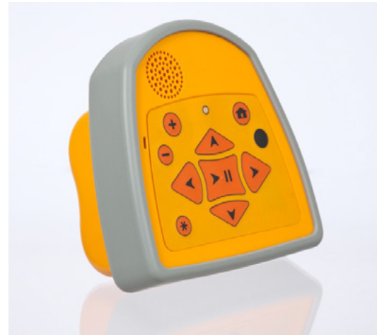
Figure 1. Prototype of the Talking Book device, 2008

The ultimate goals of the icon update were clarity and simplicity, but they also wanted the collection of icons to evoke positive feelings from the users. This meant Literacy Bridge was careful not to select a set of icons that made the device feel like a children's toy, for instance. After dozens of hours of field testing and redesigning, the team decided to change the left and right arrows to hands, while the up and down arrows were replaced with a mango tree and table, respectively. The central play/pause button was changed to a bowl, while the asterisk was changed to a five-point star. The recording circle and plus/minus icons remained unchanged (Figure 3).